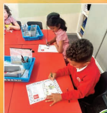
Ss Peter and Paul @sspeterpaulcoventry

Last Friday, Year 1 children enjoyed our Romero Music Morning. The children listened to different singers, made their own dance and created their own posters based on their favourite artists! Well done Year 1!