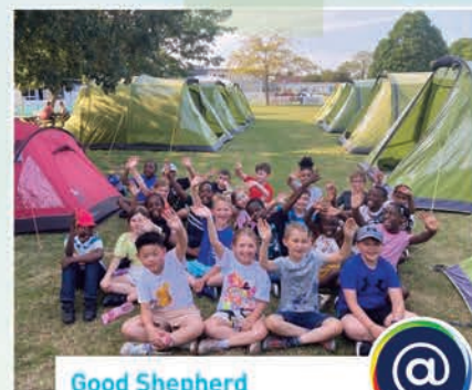
Good Shepherd @goodshepherdcoventry

We have had our chippy tea and have set up our beds for the night. Now for some fun and games before we start our campfire. #romeroexperiences