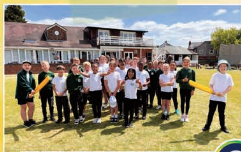
Good Shepherd @goodshepherdcoventry

Year 4 have had a great day taking part in a cricket competition. We have learnt so many new skills and shown great sportsmanship. Well done Year 4.