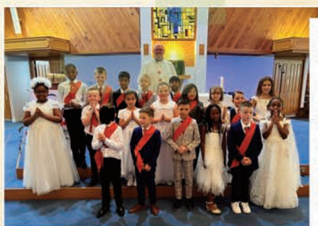
Ss Peter and Paul @sspeterpaulcoventry

COMMUNION DAY! A huge congratulations to our Year 3 children who received the special sacrament of First Holy Communion today. Thank you to all parents, carers, family and friends who helped make the day so special.