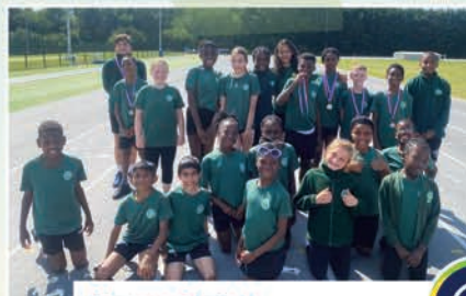
Corpus Christi @CorpusChristi

Our Athletics team participated in the annual Catholic Athletics Gala at Warwick University earlier this week.