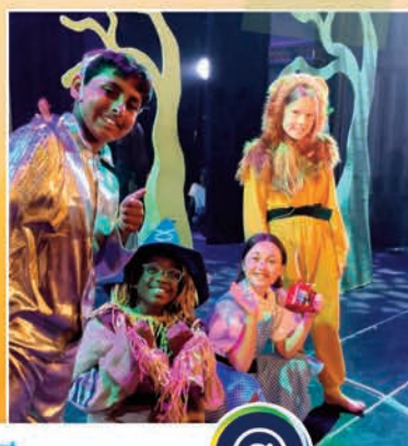
Sacred Heart @SacredHeartCov

We're off to see the wizard, the wonderful Wizard of Oz! We are so proud of our children. Their talent, dedication to learning their lines, focus and commitment meant that our show was nothing short of spectacular.