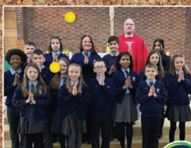
St Gregory @stgregoryscoventry

We had a wonderful celebration for our Year 6 children who took their next step on their Journey of Faith and received the Sacrament of Confirmation.