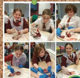
St John Fisher @SJFCoventry

Year 6 have been working hard in science learning all about the functions of the heart. They used their observation skills when dissecting these hearts to identify the parts and how they work. They were fabulous scientists!