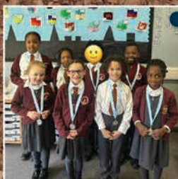
St John Fisher @SJFCoventry

A massive congratulations to our Year 3 gymnastics team who came 2nd out of all the Coventry East schools in the School Games gymnastics competition last week.