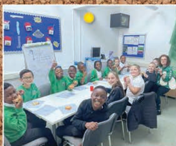
St Patricks @StPatricksCov

Cookery club have been deciding what they would like to make, going to the shop to buy the ingredients, understanding how much money they would need, working out the change they will get and then making the food to enjoy with their friends.