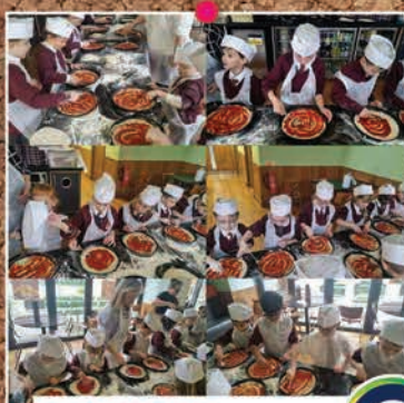
St John Fisher @SJFCoventry

As part of our Romero Child Charter 'Romero Experiences', Class 5 went on an exciting school trip to Pizza Express. The children spent the morning learning about good food, tasting a variety of fresh ingredients, and of course, making authentic, Italian pizza. They then have the pleasure of enjoying their very own pizza with friends!