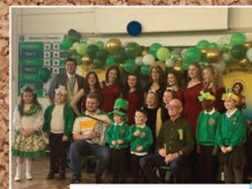
St Patricks @StPatricksCov

We had a fabulous St Patrick's day joined by musicians and dancers.