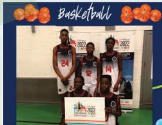
Cardinal Wiseman @OfficialWiseman

Year 9 and 10 boys at Cardinal Wiseman competed in the East Coventry Basketball Championships. The event was a trial for the upcoming International Children's Games that will be taking place in Coventry in August. Two Cardinal Wiseman boys have been selected for the team "boot camp" session that will decide who plays in the games.