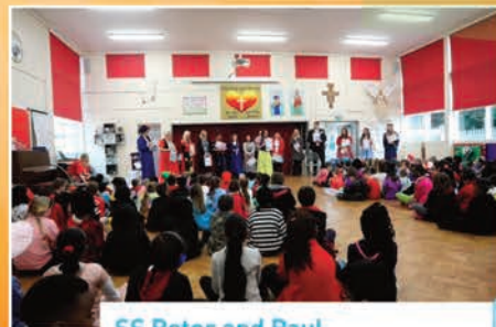
SS Peter and Paul @SSPP_Jun25

Children at SS Peter and Paul came into school dressed up as their favourite character for world book day; they also marked the occasion by singing Happy 2nd Birthday to Vinny The Vending Machine.