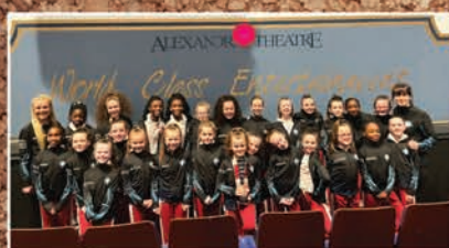
Sacred Heart @SacredHeartCov

Congratulations to Sacred Heart's dance team for winning first place at the regional heat. The children were absolutely stunning and performed as a tight unit. We are so proud of them! UK finals here we come in July!