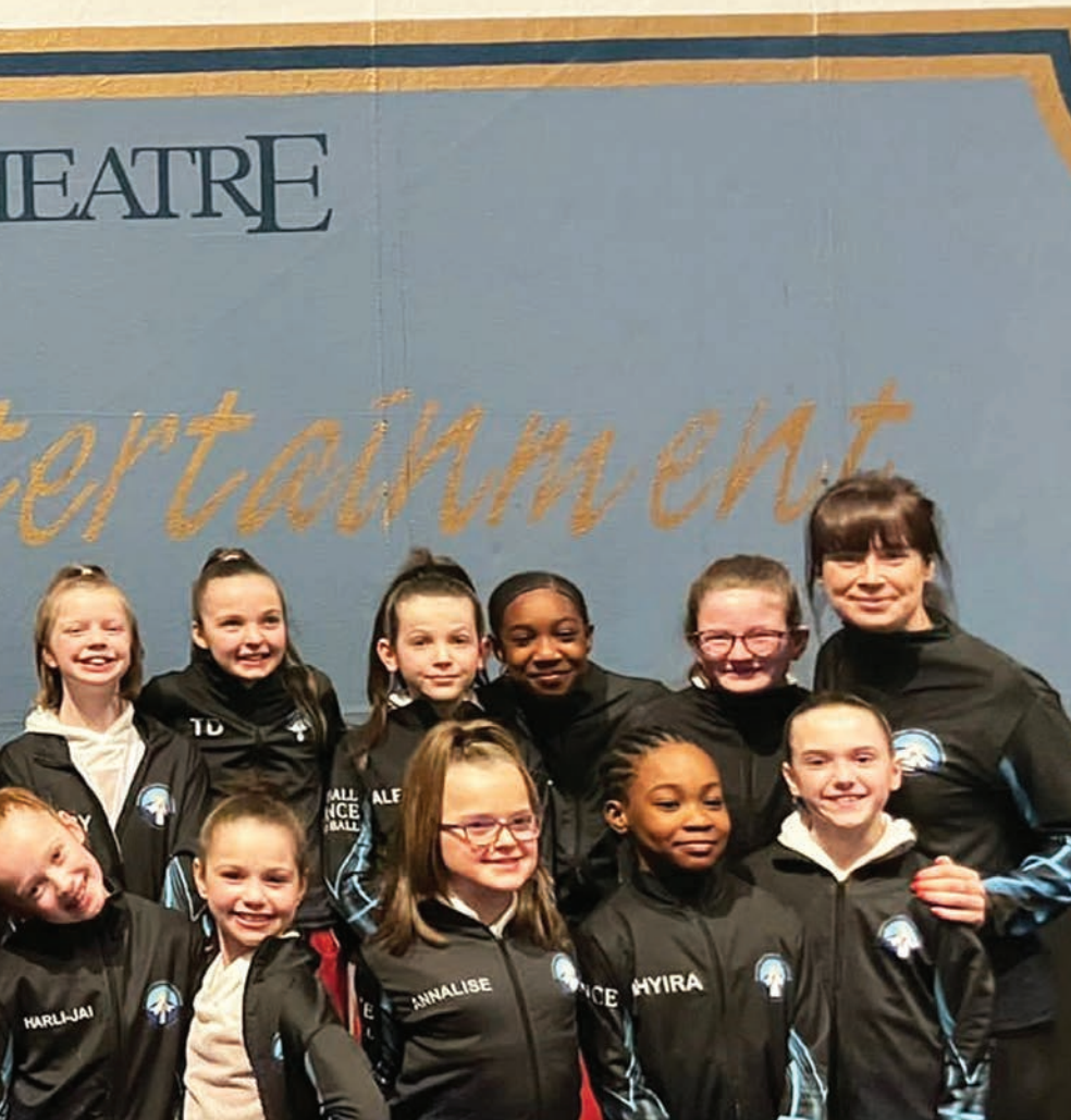
The Sacred Heart dance troupe triumphed at the West Midlands' regional finals of this year's 'Great Big Dance Off' and will now go on to compete at the national finals.

July, and the children are tweaking their routine and perfecting their moves in preparation for the event.