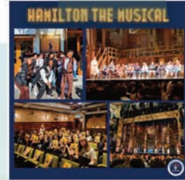
Cardinal Wiseman @OfficialWiseman

Students from Key Stage 4 and 5 had the lovely opportunity of seeing "Hamilton the Musical" at the Victoria Palace Theatre in London. The school had been invited especially for an exclusive performance, supported by the Hamilton Education Programme.