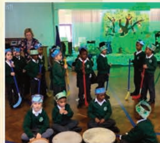
Corpus Christi @CorpusChristi

Year 1 had a great morning singing their heart's out at the Mousique Ensemble. They sang songs all about the environment with three other schools.