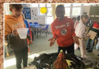
St Patricks @StPatricksCov

Year 6 have had an explosive time setting off their volcanoes.