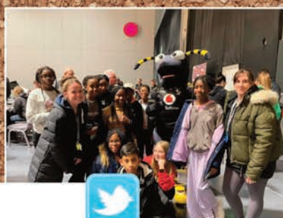
St Gregory @stgregoryscoventry

Our Netball Squad had a great night watching Wasps Netball with our friends at SS Peter and Paul, Coventry.