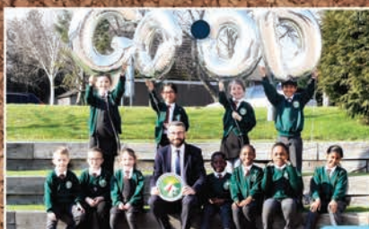
Good Shepherd @goodshepherdcoventry

Celebrating our Good with outstanding features Ofsted result!