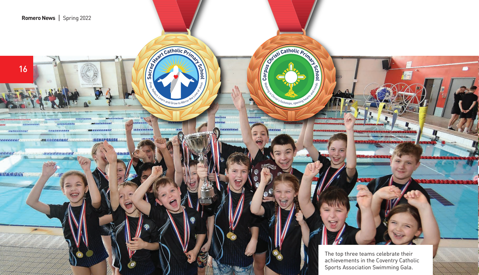
The top three teams celebrate their achievements in the Coventry Catholic Sports Association Swimming Gala.