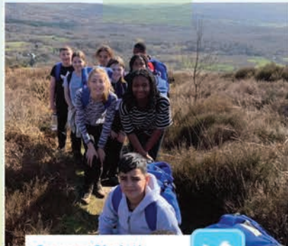
Corpus Christi @CorpusChristi

Year 6 had a fantastic trip away at Dol-Y-Moch. They had beautiful weather and enjoyed lots of fun outdoor activities making memories.