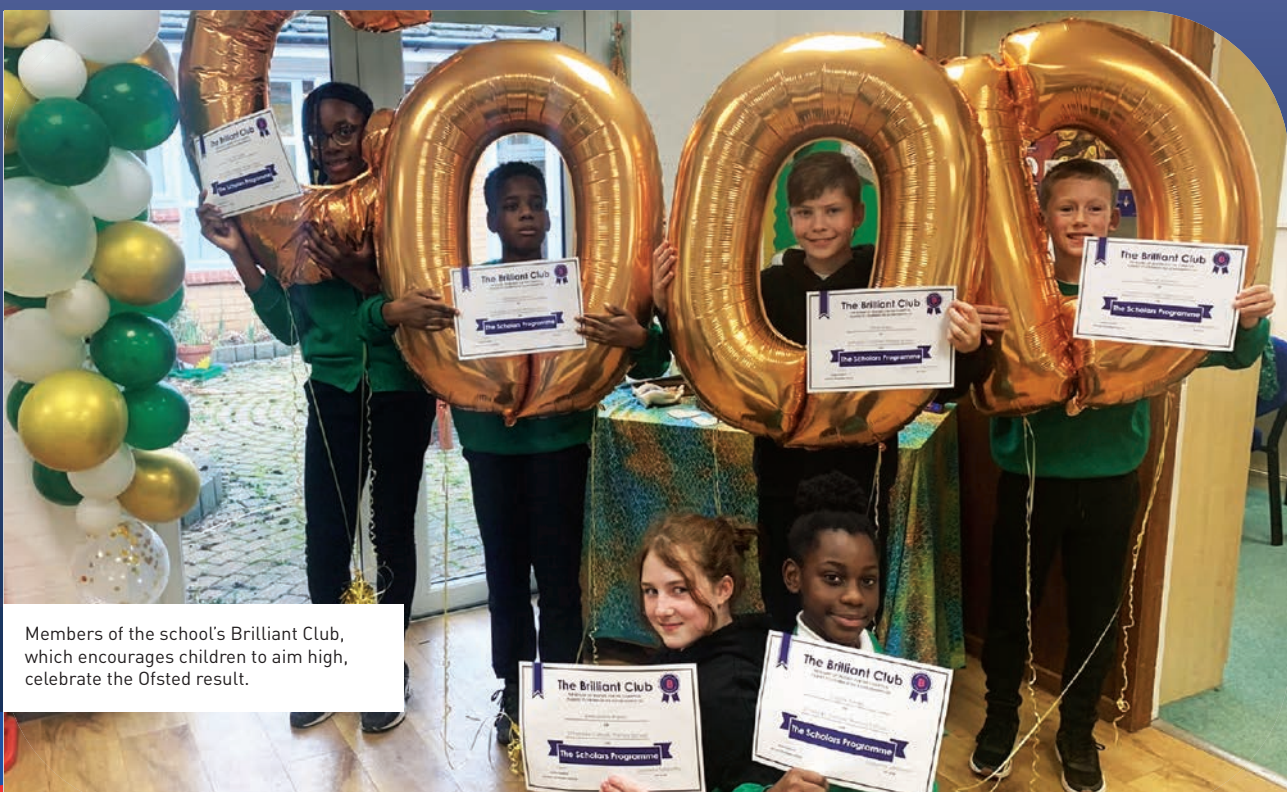
Members of the school's Brilliant Club, which encourages children to aim high, celebrate the Ofsted result.

"I would like to congratulate everyone involved in this much-deserved achievement."