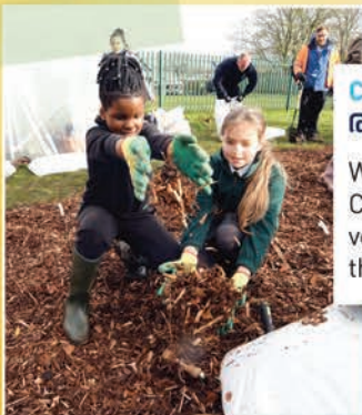
Corpus Christi @CorpusChristi

We now have a tiny forest at Corpus Christi. Our children had a very memorable adding their mark to the history of the school.