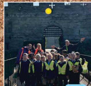
St Gregory @stgregoryscoventry

On Friday 18th March, the sun was shining, and Year 1 had a wonderful day learning about life in a castle in the middle ages.