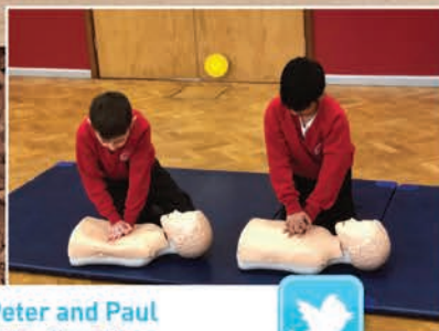
SS Peter and Paul @SSPP_Jun25

Ss Peter and Paul had a visit from Mini First Aid to teach Year 4 children some basic first aid knowledge.