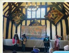
Corpus Christi @CorpusPrimary

Year 2 had an amazing day at Selly Manor!