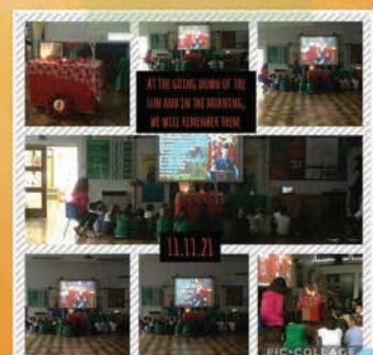
St Patrick's @StPatricksCov

Every year group took part in Remembrance day rolling prayer. Well done everyone!