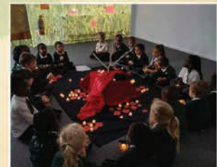
Corpus Christi @CorpusPrimary

@Corpuschristiprimary Remembrance Day - Reception's collective worship. We will remember. #romerorefects