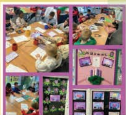
St John Fisher @SJF

Year 3 working hard on Advent art day to prepare our classroom for Advent.