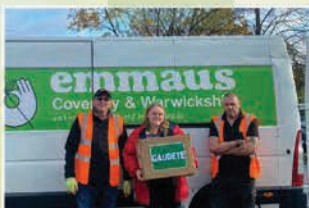
Cardinal Wiseman @OfficialWiseman

Food donations from our pupils for the Emmaus Charity who work with the homeless in Coventry providing shelter and food.