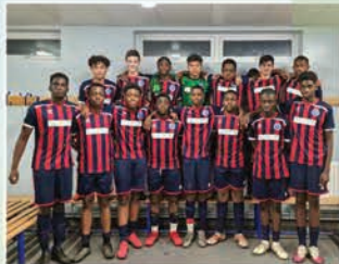
Cardinal Wiseman @OfficialWiseman

Cardinal Wiseman's Year 11 football team after their 5-0 win for the 2nd round of the West Midlands Schools' Cup.