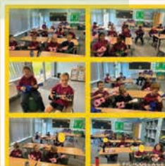
St John Fisher @SJF

Year 3 have had great fun learning how to play the ukulele this afternoon.