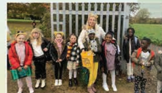
Corpus Christi @CorpusPrimary

Thank you for all your Pudsey donations! We raised over £400, amazing!