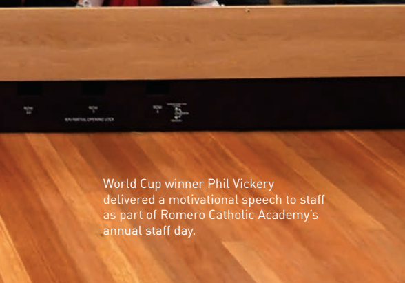
World Cup winner Phil Vickery delivered a motivational speech to staff as part of Romero Catholic Academy's annual staff day.

“... the message that I wanted to impart today - having a great headteacher alone doesn’t make a great school, it takes everyone.”