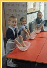
St Gregory's @StGregsPrimary

Today Year 2 became brilliant bakers and made their own bread. It was a great way to bring their learning to life and imagine what Pudding Lane Bakery was like at the time of the Great Fire of London. They looked and smelt amazing!