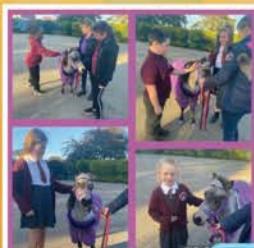
St John Fisher @SJF

Wraparound had a great time meeting our new friend Boo. #theraponywithboo