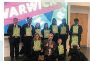
Cardinal Wiseman @OfficialWiseman