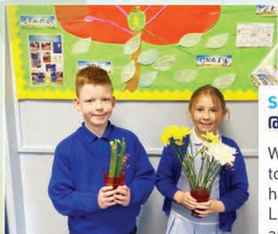
Sacred Heart School @SacredHeartCov_Jun28

We've added food colouring to the water and predicted what will happen to the flowers and celery! Lets see if our Scientific Predictions are correct!