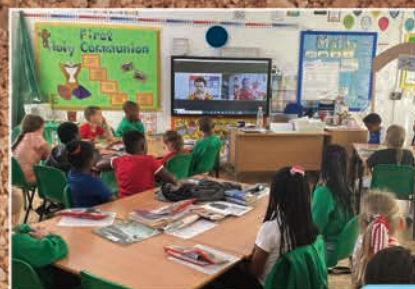
St Patrick's @StPatricksCov_Jun11