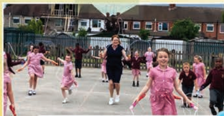
St John Fisher @SJF_Jun15

This weeks #cswyouskip challenge is to post photos of our families participating in skipping!