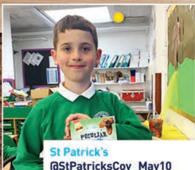
St Patrick's @StPatricksCov_May10

We are very proud of one of our Year 3 children who has had their poem published in the @youngwriters Peculiar Pets book!