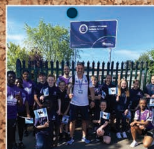
Cardinal Wiseman @OfficialWiseman_Jun8

It was great celebrating #NationalBestFriendDay with the Olympic Torch!