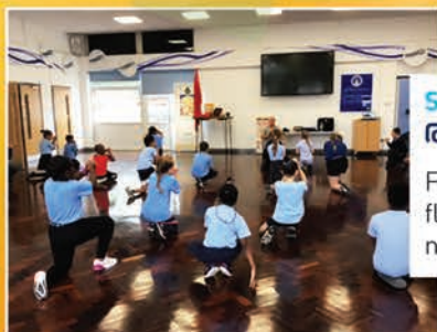
St Gregory's @StGregorysPrimary_June21

From Pirates to Abba, from flossing to hand jiving...today was nothing short of phenomenal!