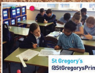
St Gregory's @StGregorysPrimary_Jun24

Year 4 are busy planning their podcasts in computing today!