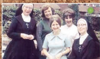
The Wiseman Connection @TheWisemanConnection