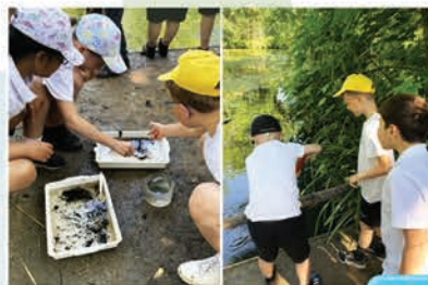
Corpus Christi @Corpusprimary_Jun17

Year 4 had a wonderful day at Coombe Abbey for their River study experience.