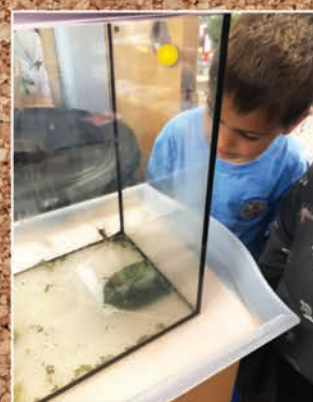
Corpus Christi @CorpusChristi_Jun24

Yesterday, some of our Year 5 & 6 students took part in the Coventry Catholic Schools Athletics Competition.