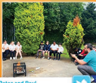
SS Peter and Paul @SSPP_Jun25

Year 6 finished off a fantastic retreat day by baking cookies.