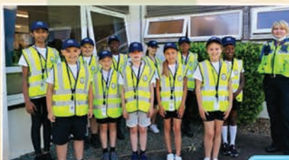
Good Shepherd @GoodShepherdCOV_Jun17

We have started a new group called Young Junior PCSO's. We are working together as a team with the police!