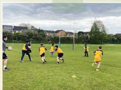
Cardinal Wiseman @OfficalWiseman_May25

It was great having the @waspsrugby back teaching our after school Year 7 club!