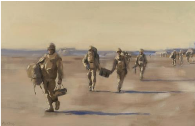
'Leaving Camp' by Arabella Dorman