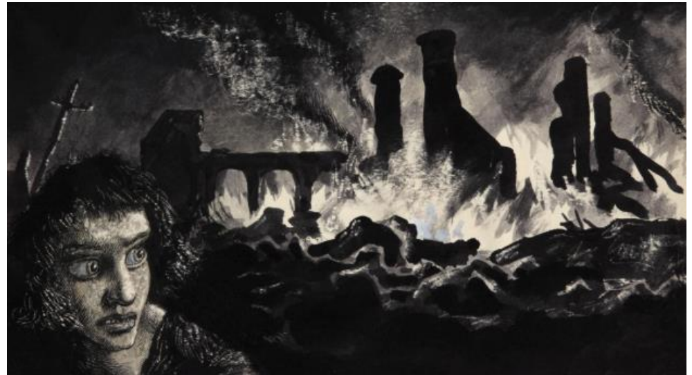
'Head by Firelight' by Mervyn Peake