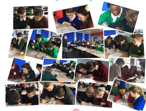
The Romero Academy